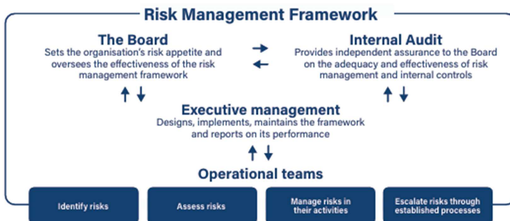
Figure 3 – Risk Management Framework

The Board is also supported by the Sustainability Committee which oversees the development and implementation of the Company's sustainability strategy as presented in Figure 4, policies and standards on matters of social responsibility and human rights; environmental responsibility; workplace health, safety and labour rights, as described in the Committee Charter (refer Sustainability Committee Charter ).