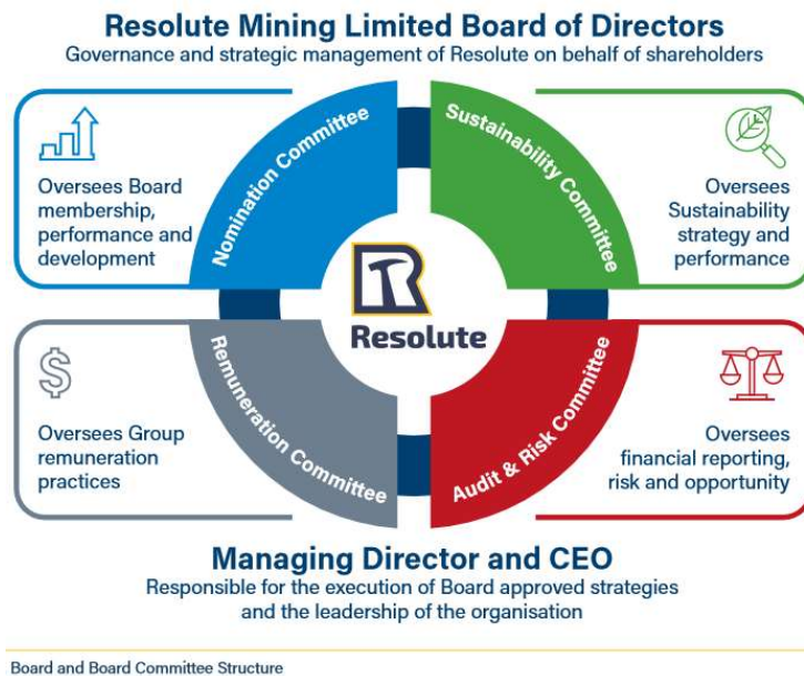
Figure 2 – Board and Committee Structure

The Audit and Risk Committee is mandated by the Board to provide risk management oversight across material exposures. The Audit and Risk Committee works closely with management in relation to the assessment, monitoring and ongoing management of business risk across all time horizons and to carry out assessments of internal controls and processes for improvement, as per the Committee Charter (refer Audit and Risk Committee Charter ). Our approach to risk management and the results of our risk review are presented in the 2025 Annual Report, pages 60 to 66 (refer RML 2025 Annual Report ).